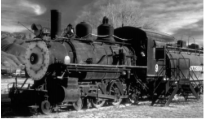
This is a stock photo because Gordo forgot to budget for art.